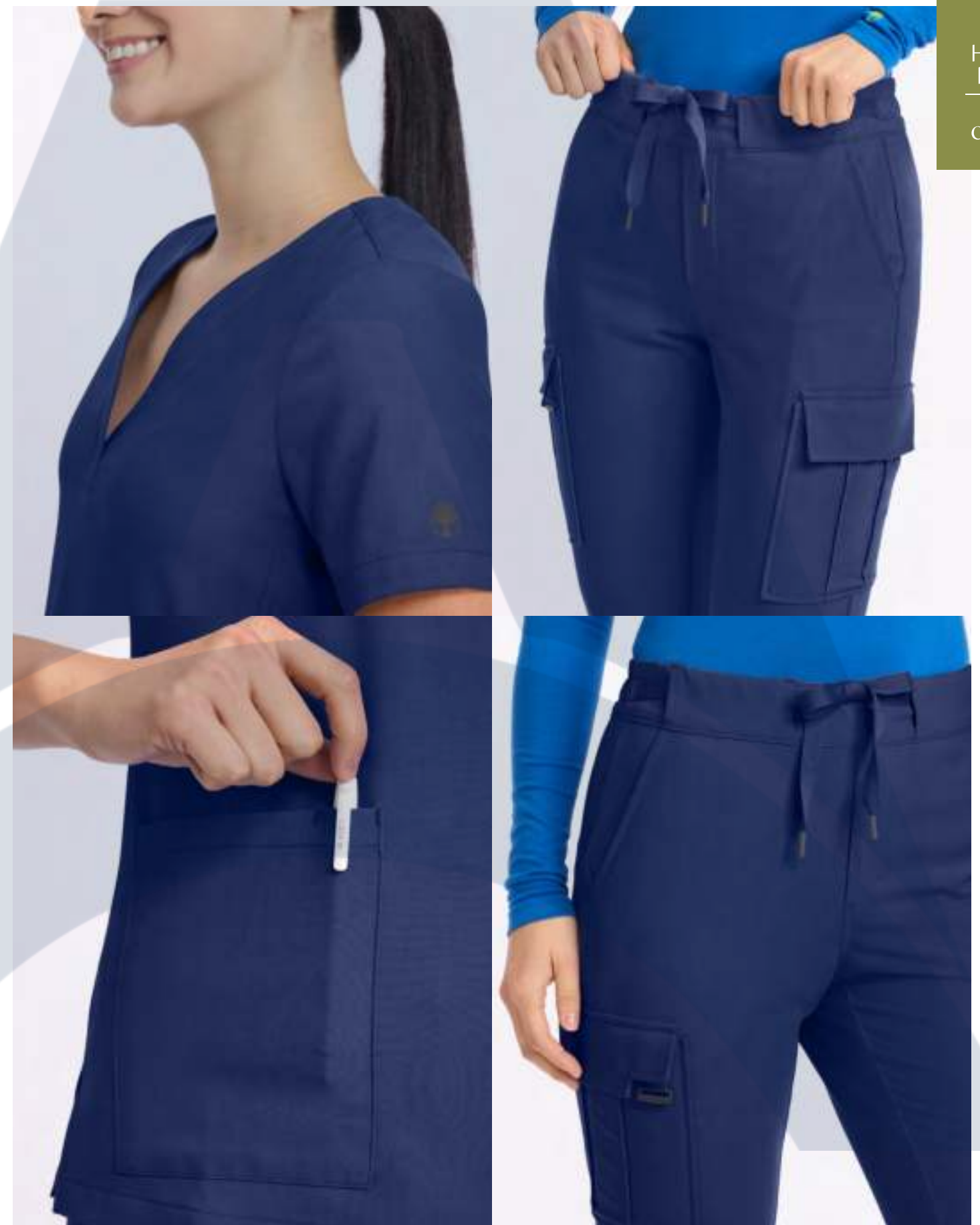
FEMALE MODEL WEARING: HH751 and HH150