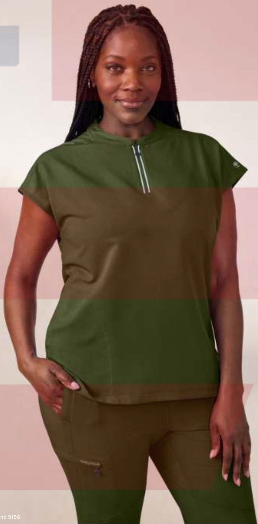
MODEL WEARING: 2274 and 9156